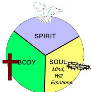
You are a 3 PART BEING